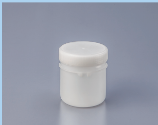
300 ml container