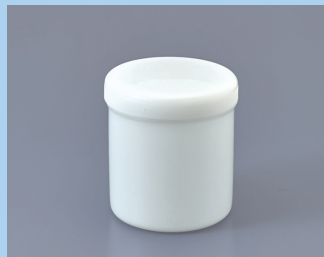
550 ml container